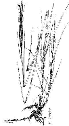
Smooth cordgrass Spartina alterniflora

Young fish often have a varied diet, foraging for food in the mud of the marsh bottom, on the plants themselves, and on smaller organisms that dwell in the marsh system. After salt-marsh plants die, they become detritus, a product of decomposition by microorganisms. Detritus is food for many small animals. Tidal waters move up into the marsh and then retreat, carrying and distributing detritus throughout the estuary.