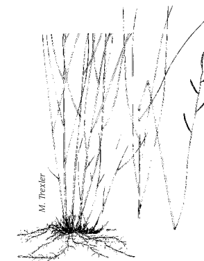
Marsh-hay Spartina patens

Salt marshes have been drained, filled, or dredged to provide land for development or deep channels for boats. In Florida, at least 60,000 acres, or 8%, of estuarine habitats, including salt marshes, have been lost to permitted dredge-and-fill activities.