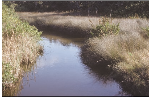
A high marsh of needle rush, Juncus roemerianus , with brown-fringed clusters of giant leather fern, Acrostichum aureum .

State regulations have been enacted to protect Florida's salt marshes and other coastal communities. Specifically, the Warren B. Henderson Wetlands Act of 1984 established clear guidelines for defining wetlands under state jurisdiction. All dredging and filling activities in state waters require permits unless specifically exempted. Local laws vary, so be sure to check with officials in your area before taking any action.