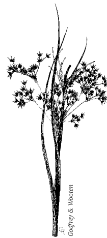
Sawgrass Cladium jamaicense

Salt marshes form along the margins of many north Florida estuaries. Gulf-coast salt marshes occur along low-energy shorelines, at the mouths of rivers, and in bays, bayous, and sounds. The panhandle region west of Apalachicola Bay contains estuaries with few salt marshes. From Apalachicola Bay south to Tampa Bay, however, salt marshes are the main type of coastal vegetation. The most continuous salt marsh acreage in Florida lies in the coastal area known as "The Big Bend," which extends from Apalachicola Bay to Cedar Key. South of Cedar Key, salt marshes contain an increasing proportion of mangroves, which are south Florida's dominant coastal vegetation. On the Atlantic coast, salt marshes occur from Daytona Beach northward. Nevertheless, salt-marsh plants can still